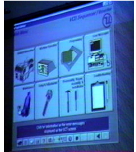
This bilingual application emphasised large graphics to help navigate.

PDP employs people with technical backgrounds who can quickly learn the essence of the clients' machines and write the applications and training manuals.